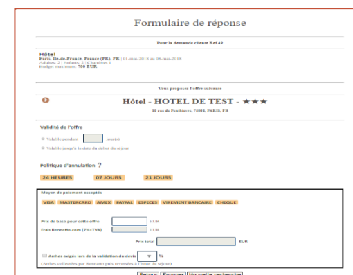
Example response form at an accommodation request