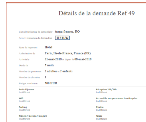
Example of accommodation request

Another advantage of our platform, the possibility of conversing directly with the future guest and thus prepare the best delivery. All these exchanges are recorded in the quote to avoid any future dispute.